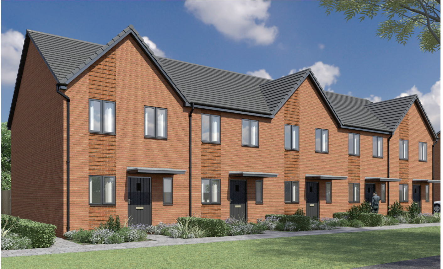
CGI Drawing of a typical terrace plot

Plots 27, 28, 29, 30, 31, 39, 40, 41, 42 & 43