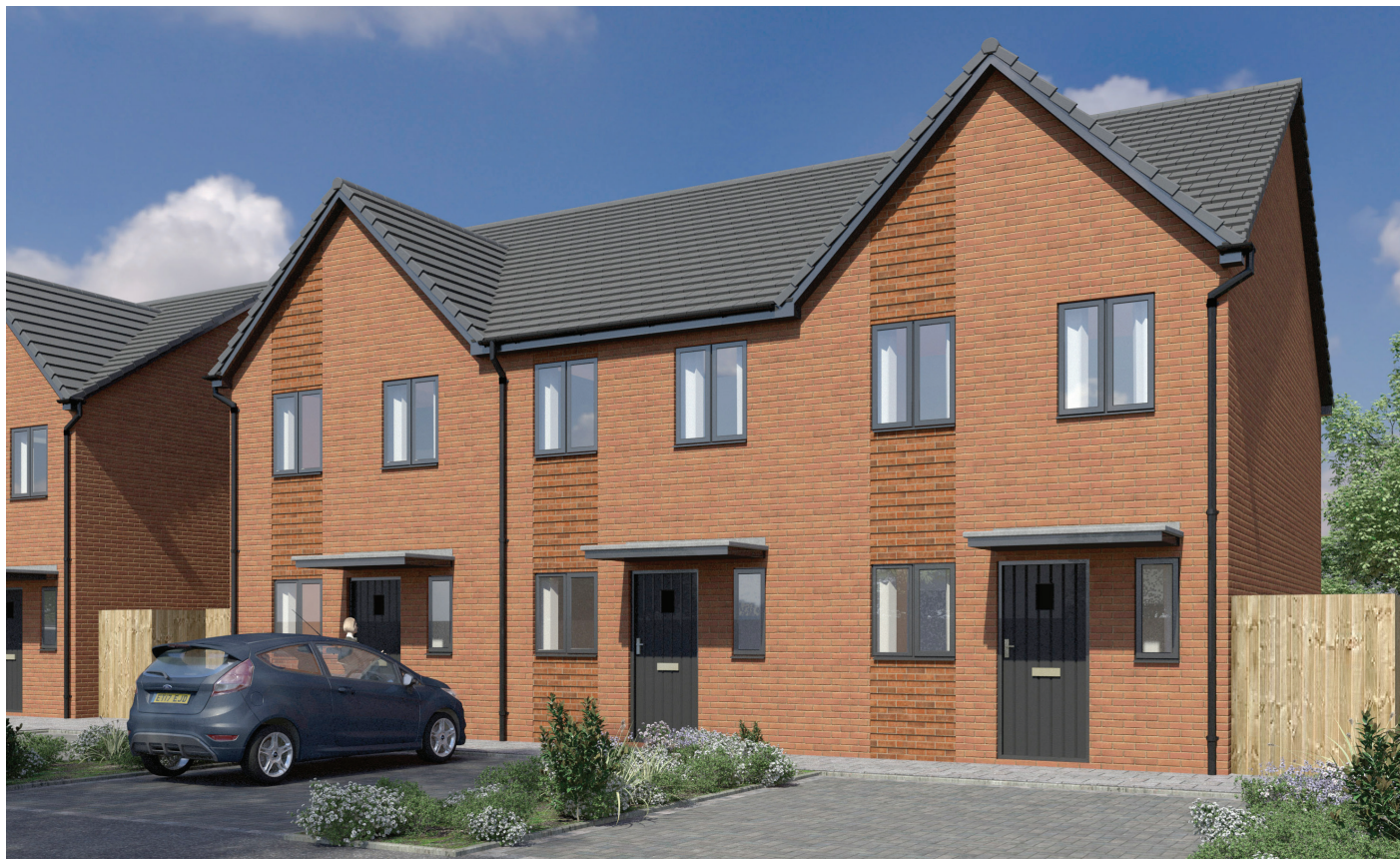
CGI Drawing of a typical terrace plot