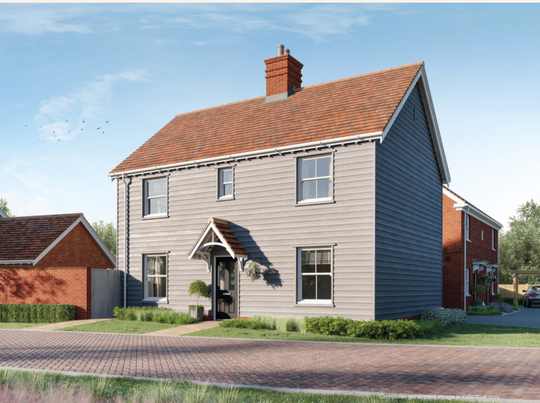
Computer generated image is indicative only