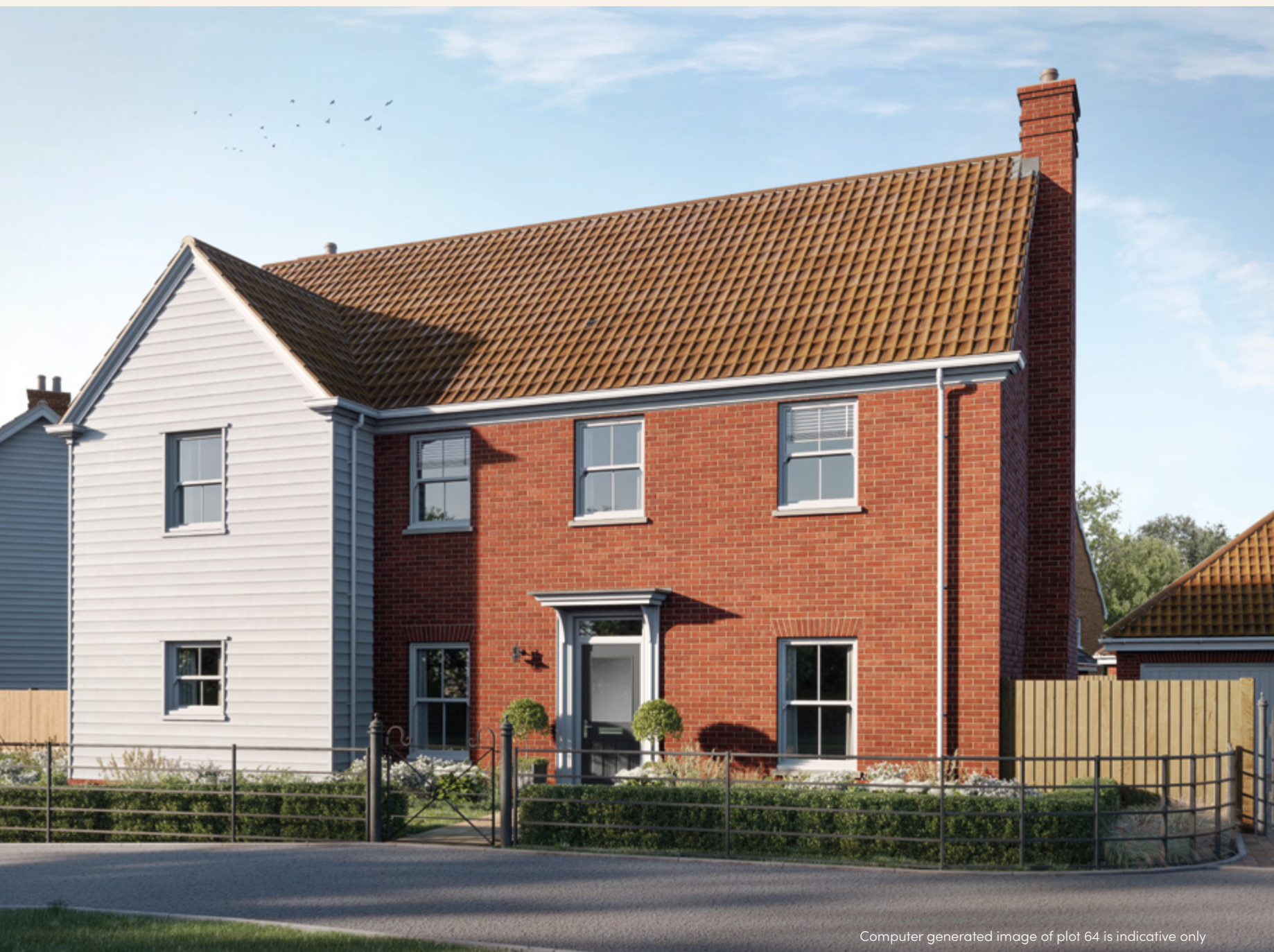
Computer generated image of plot 64 is indicative only